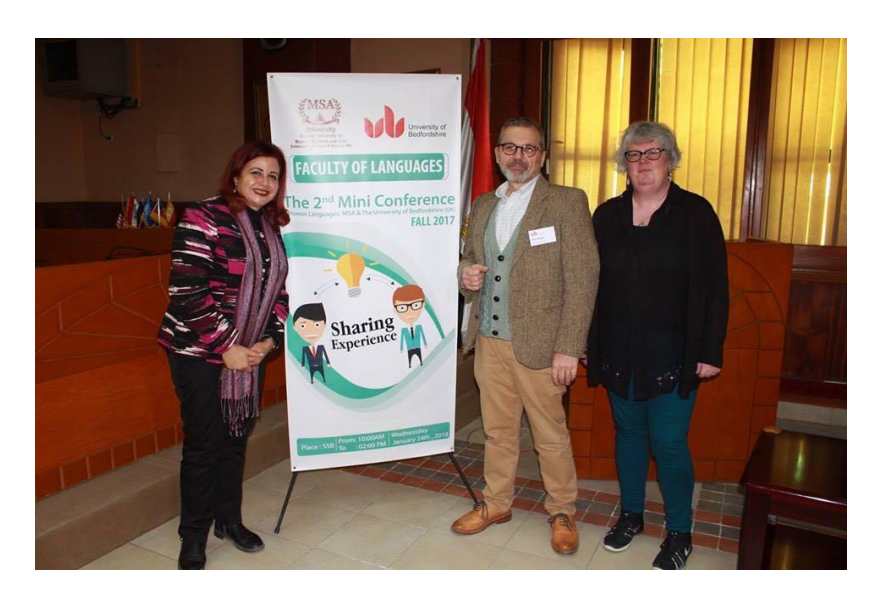
Dean Of the Faculty of Languages with UOB moderators

The Faculty of Languages-MSA University hosted the second Mini-Conference in collaboration with its academic partner, the University of Bedfordshire (UK). This academic event aims to provide the staff of both parties with the opportunity to present and share their views and current research work in order to share experience and inspire scholars. Each Presenter gives a twenty-minute presentation on one of the topics in the fields of linguistics, literature, translation and TEFL. The conference is also a lively forum for discussion among partners/colleagues who share the same academic interests. This would benefit the education processes and the academic/ research environment of both parties.